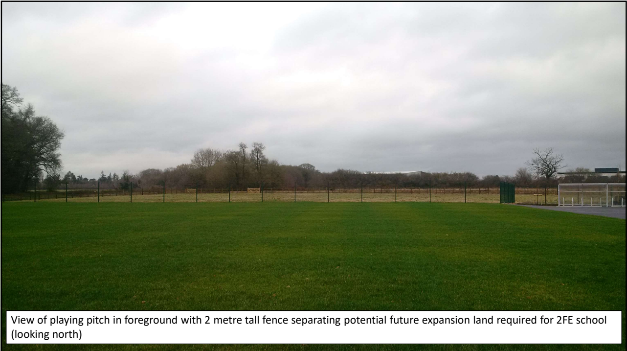
View of playing pitch in foreground with 2 metre tall fence separating potential future expansion land required for 2FE school (looking north)