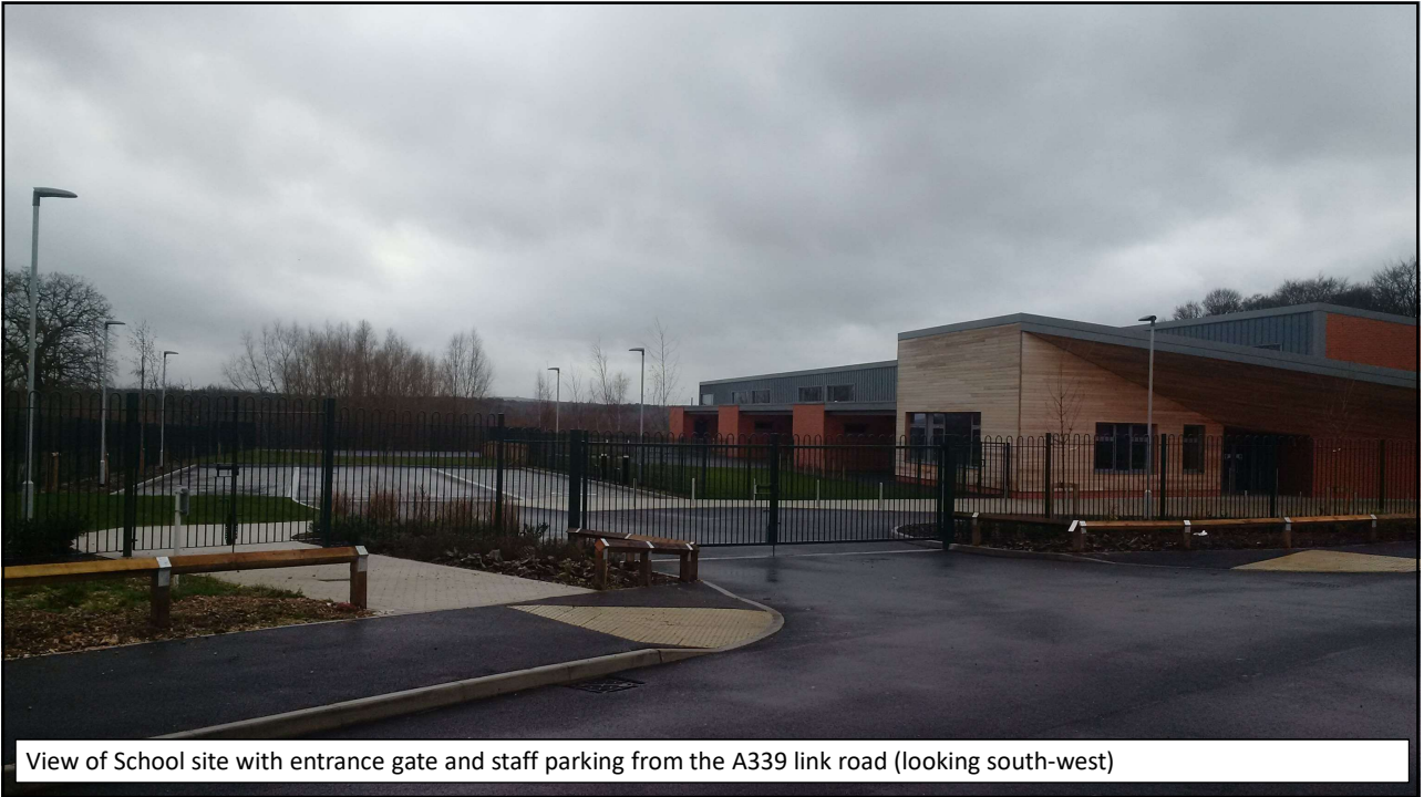
View of School site with entrance gate and staff parking from the A339 link road (looking south-west)