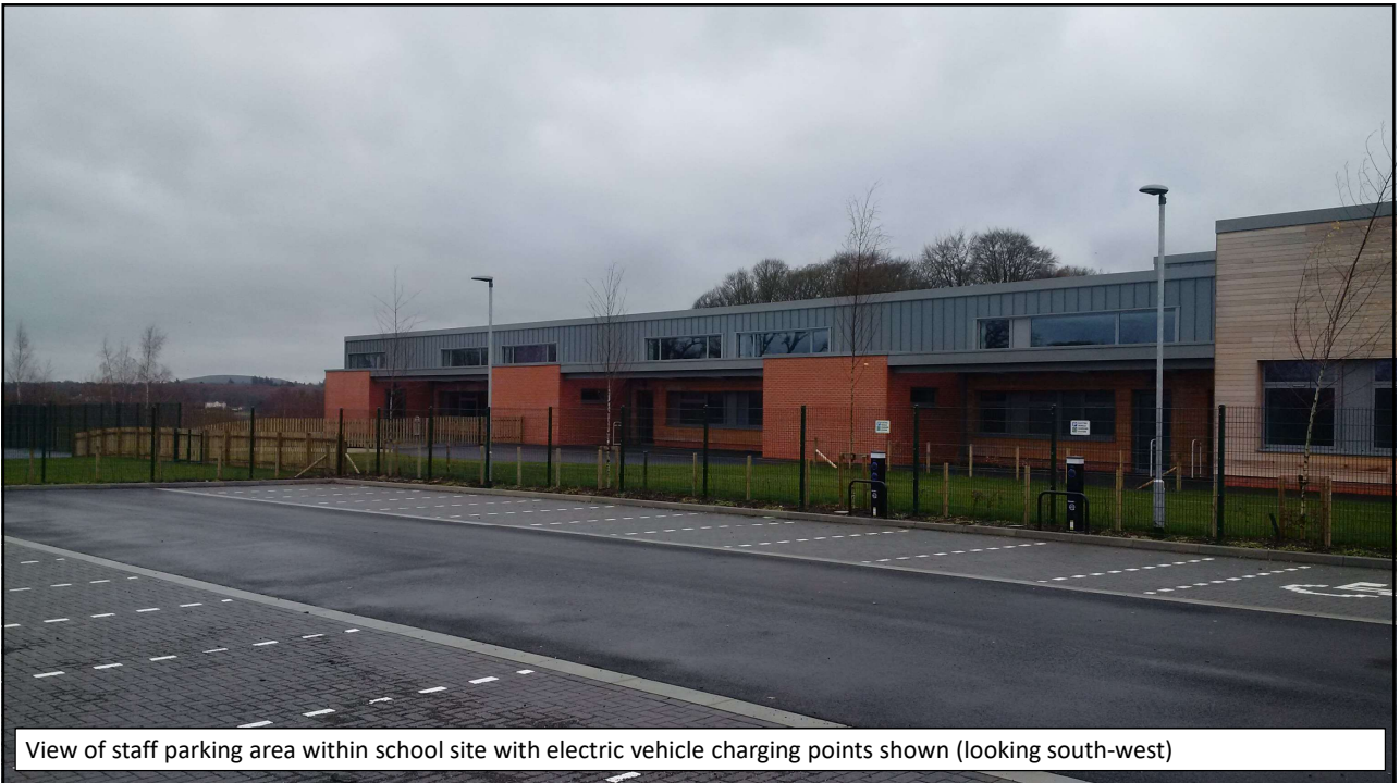
View of staff parking area within school site with electric vehicle charging points shown (looking south-west)