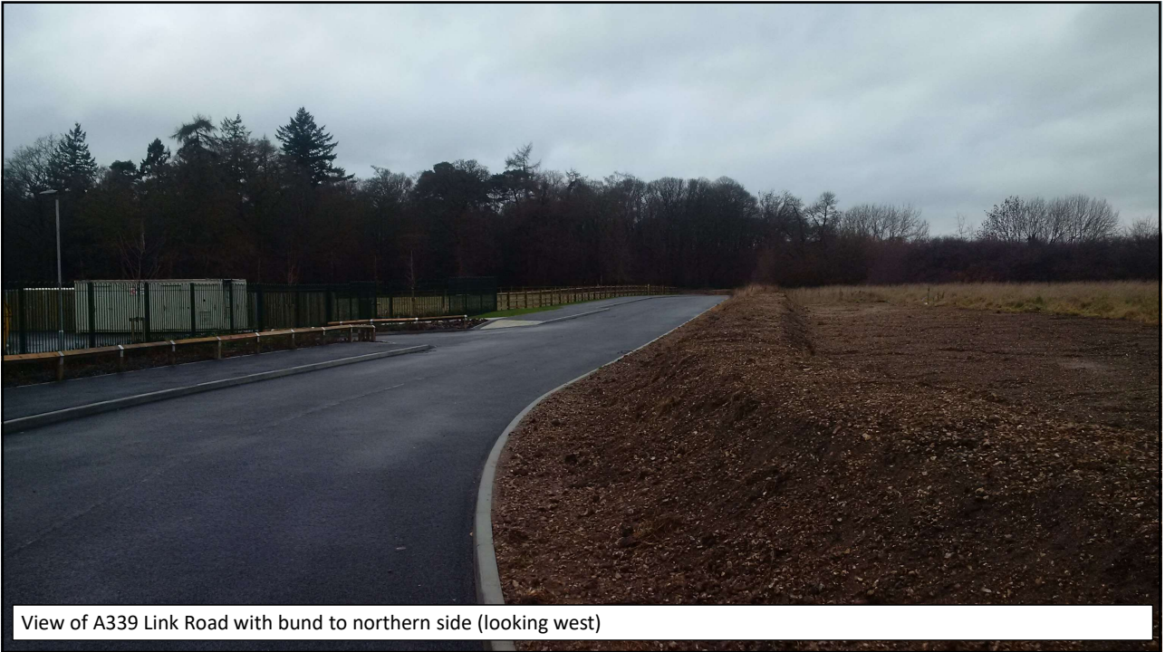
View of A339 Link Road with bund to northern side (looking west)