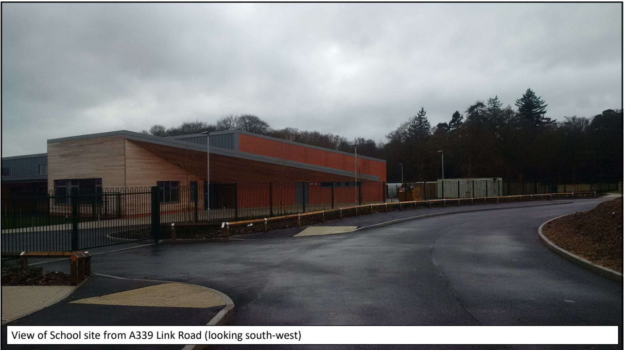
View of School site from A339 Link Road (looking south-west)