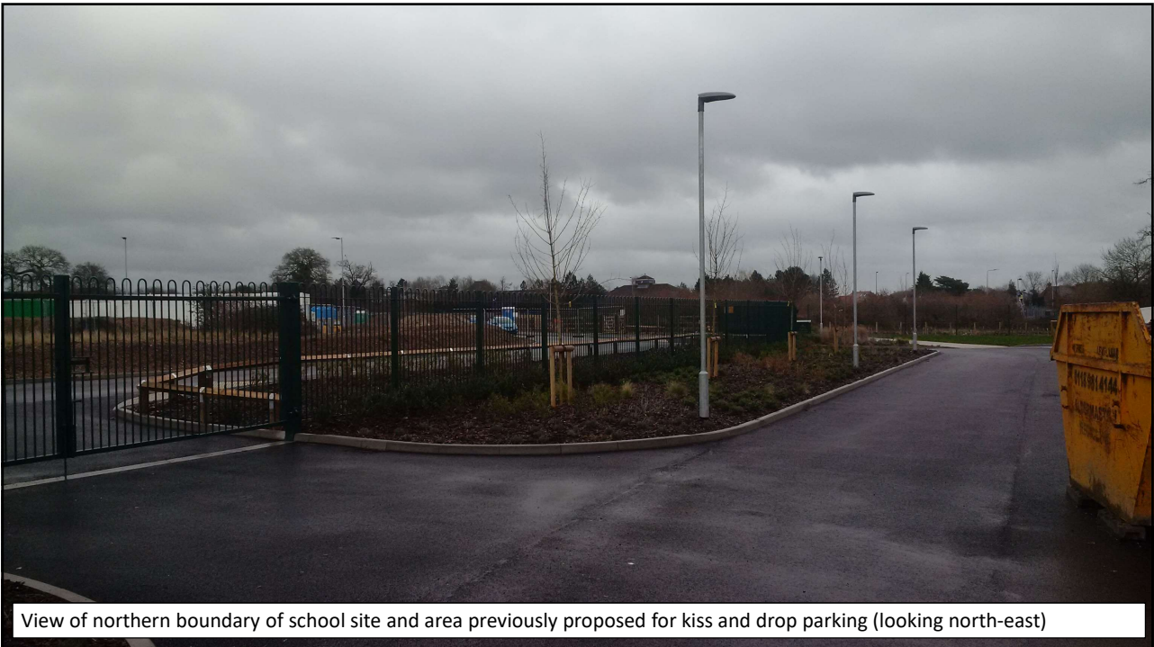
View of northern boundary of school site and area previously proposed for kiss and drop parking (looking north-east)