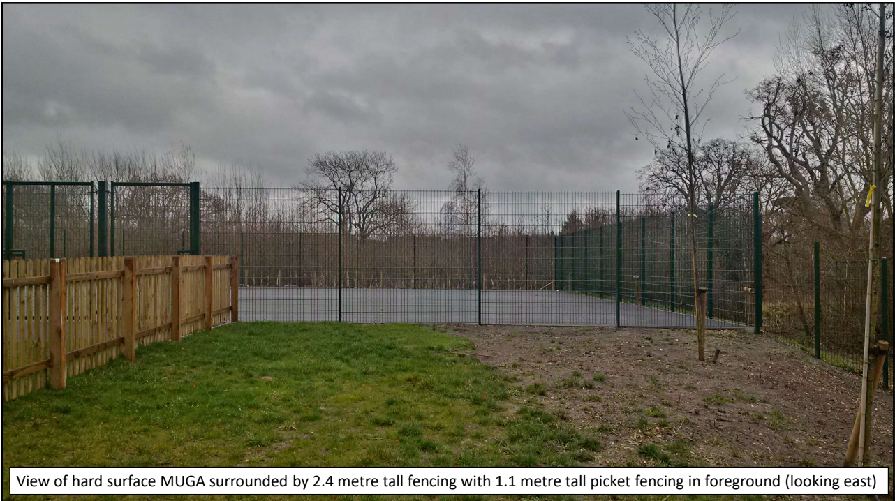
View of hard surface MUGA surrounded by 2.4 metre tall fencing with 1.1 metre tall picket fencing in foreground (looking east)