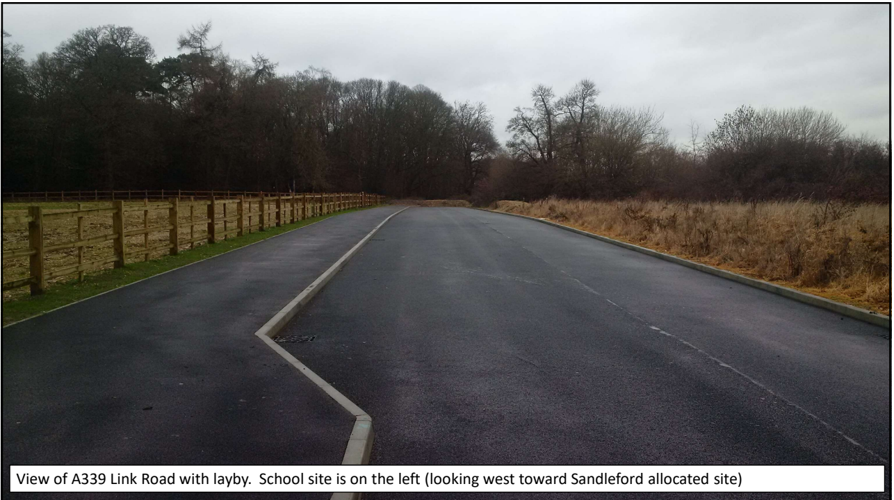
View of A339 Link Road with layby. School site is on the left (looking west toward Sandleford allocated site)