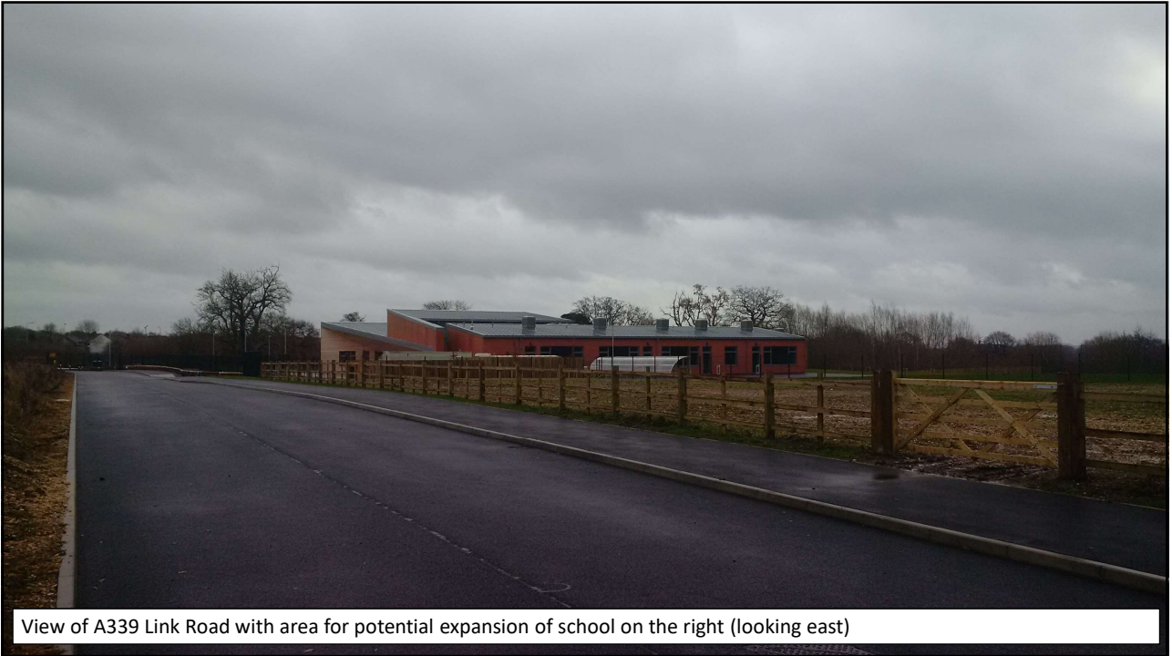
View of A339 Link Road with area for potential expansion of school on the right (looking east)