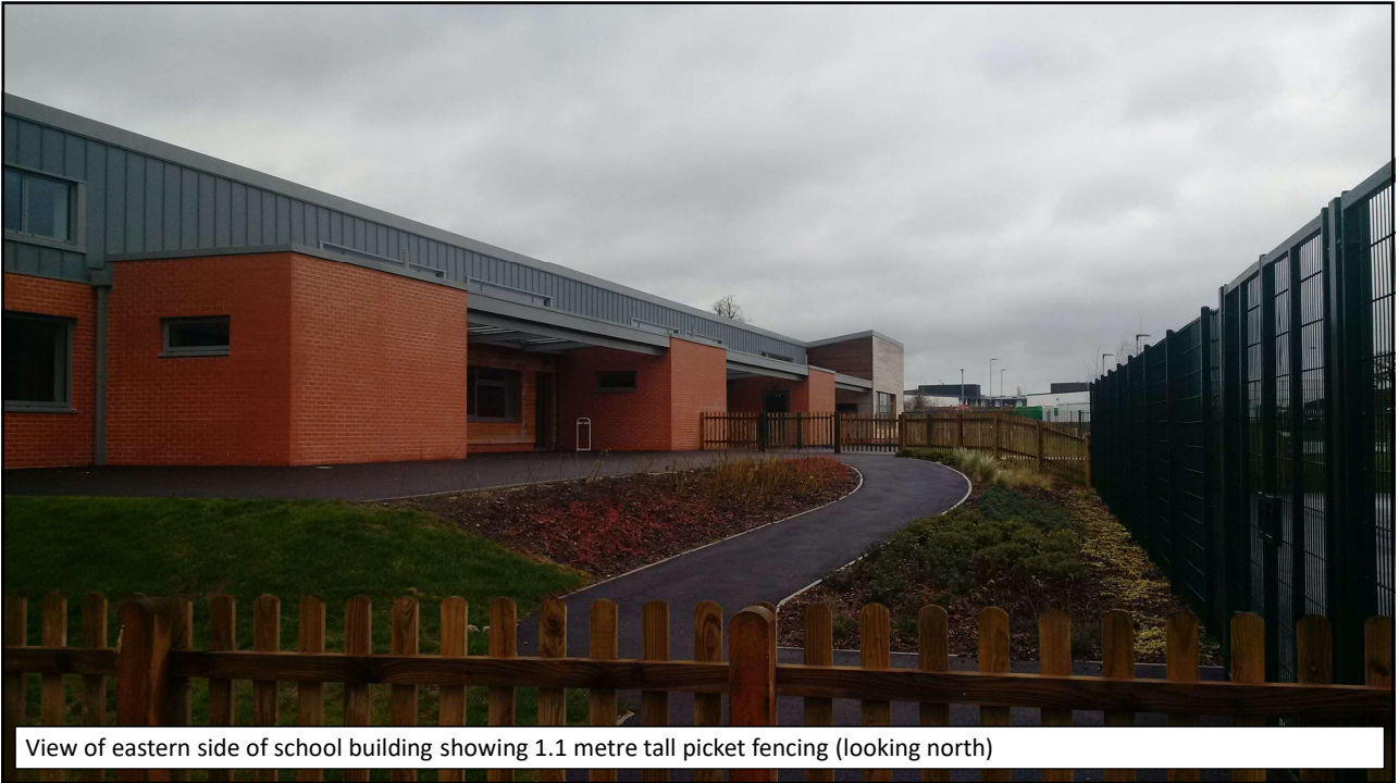
View of eastern side of school building showing 1.1 metre tall picket fencing (looking north)