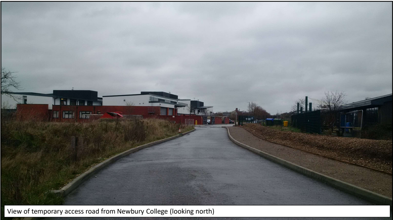
View of temporary access road from Newbury College (looking north)

Photographs for Western Area Planning Committee Application 20/02779/COMIND